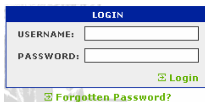
Figure 2 - “Login” Form